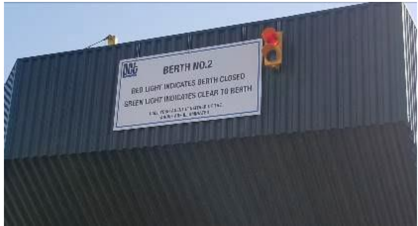
Photo 4: Berthing indicator light located on the chute storage tower at the east end of berth 2.