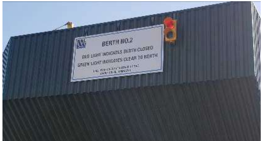
Photo 4: Berthing indicator light located on the chute storage tower at the east end of berth 2.