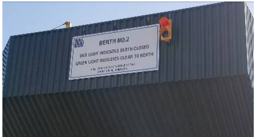
Photo 4: Berthing indicator light located on the chute storage tower at the east end of berth 2.