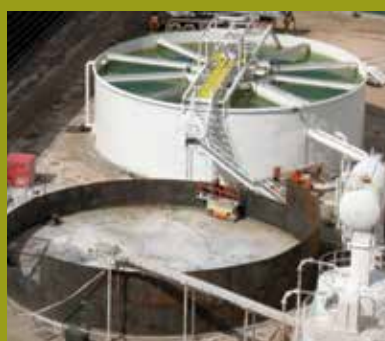
New water clarifier