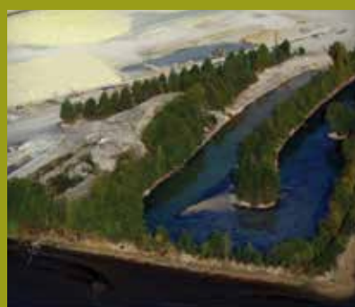
Current settling pond

Residential Impact: Residents may observe construction of one large tank and one smaller tank adjacent to the existing settling pond. Construction traffic (primarily trucks) may be observed and heard throughout the construction period.